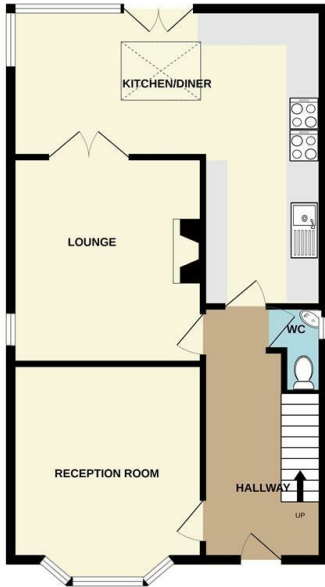
GROUND FLOOR 662 sq.ft. (61.5 sq.m.) approx.